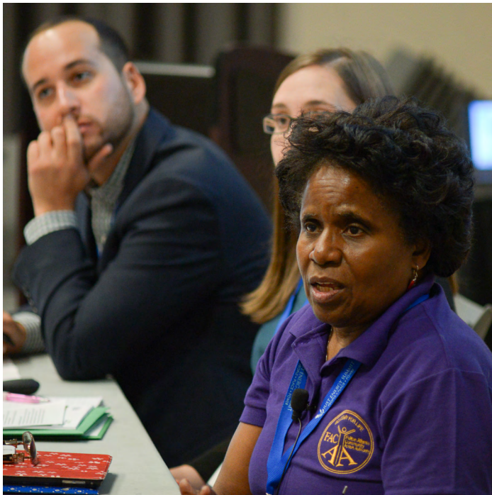
Community advocates and energy equity organizers gathered for PSE's first Just Energy Summit in 2016 at Atlanta Metropolitan State College in Atlanta, GA.