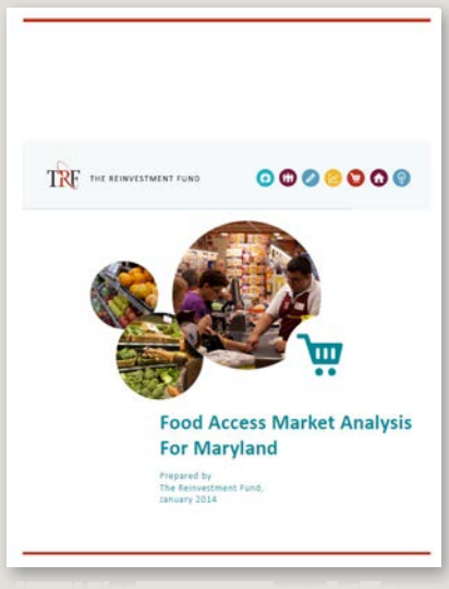
Food Access Market Analysis for Maryland (2014)