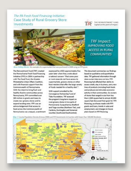
The PA Fresh Food Financing Initiative: Case Study of Rural Grocery Store Investments (2012)

http://www.trfund.com/impact/research-publications/